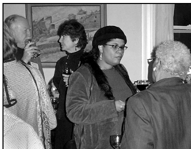
Guests enjoy wine and conversation