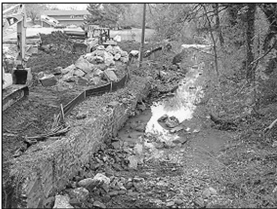
Woodlawn H. S. project, before (above) and after (right)

low-up public meeting is planned for mid-July.